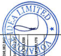
TABLE II - STATEMENT SHOWING SHAREHOLDING PATTERN OF THE PROMOTER AND PROMOTER GROUP